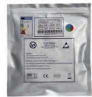
REEL / ANTI-STATIC BAG