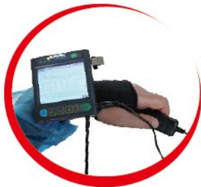
Compact & Lightweight 0.5KG only