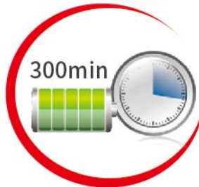
Large capacity lithium battery, 5 hours