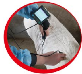
Backfat measurement Lean Percentage Measurement