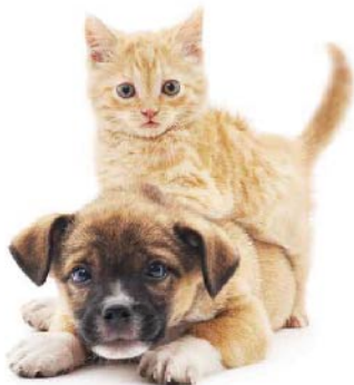
Also good for imaging pets