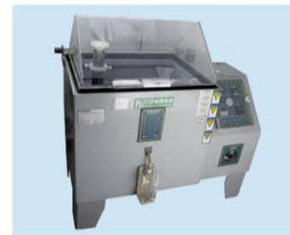
盐雾试验机 Salt spraying testing machine