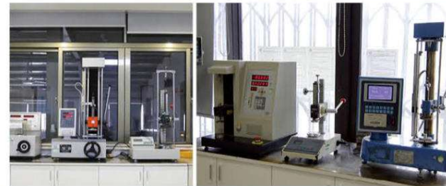
拉压试验机 Tensile and compression testing machine

Every inspection process ensures that every product is in strict accordance with national and international standards for production and testing, and implements whole-process control from the purchase of raw materials to the delivery of finished products. Develop the quality policy of "customer demand as the center, production management as the foundation, continuous improvement of the quality system, improve customer satisfaction products".