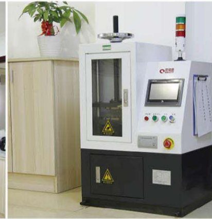
疲劳试验机 Fatigue testing machine