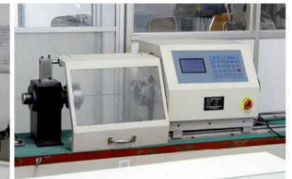
扭转试验机 Torsion testing machine