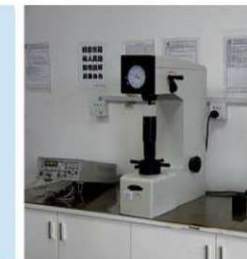
硬度试验机 Hardness testing machine