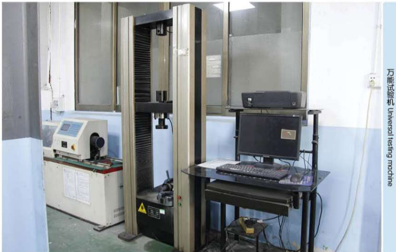
万能试验机 Universal testing machine

一道道检验工序，确保每个产品严格按照国家标准和国际标准组织生产检测，从原材料购进到成品出库实行全过程控制。制定“以客户需求为中心，以生产管理为基础，持续改进质量体系，提高用户满意产品”的质量方针。