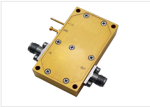
Note: The photo is for illustration purposes only. Please refer to outline drawing