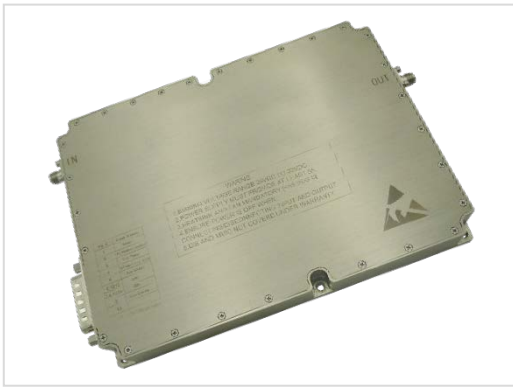
Note: The photo is for illustration purposes only. Please refer to outline drawing