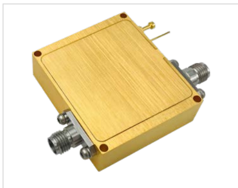
Note: The photo is for illustration purposes only. Please refer to outline drawing