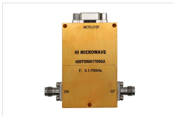
Note: The photo is for illustration purposes only. Please refer to outline drawing