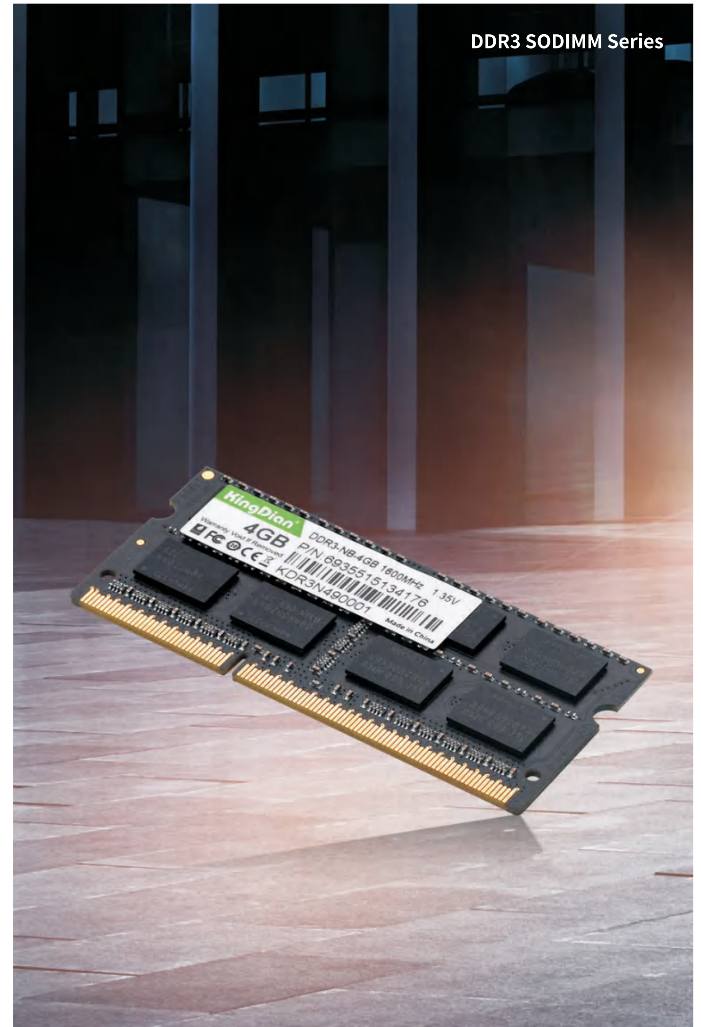
DDR3 SODIMM Series